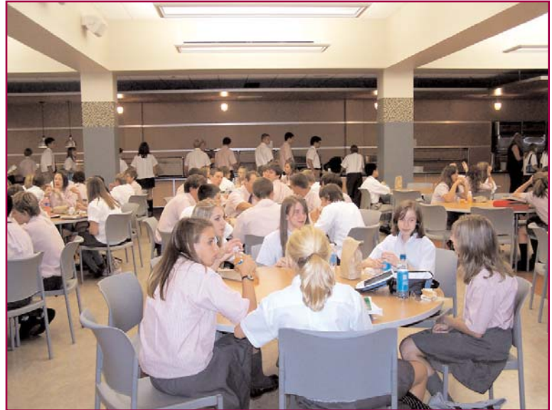
Students were amazed at the new Cafetorium facilities upon their return to school on Aug. 21. The ground floor was completely redone, including construction of a new, high-tech stage and new restrooms.

In addition to the Cafetorium and new kitchen equipment, summer renovations work also included a new Fine Arts Center to accommodate band/choir/drama practices and house musical instruments, new office space for CCHS Chaplain Fr. Dennis Schuelkens, a new Knight Stand area, storage areas, restroom facilities, and beautiful new glass doors at all four of the school's entrances.